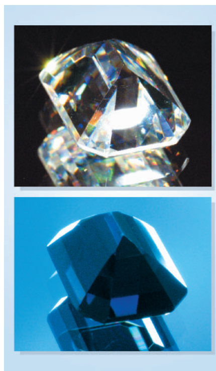
Figure 1 Now you see it, now you don't. These micrographs of a SrTiO 3 crystal show the effect of removing oxygen atoms, leaving vacancies in the crystal lattice: the glistening oxidized gem (top) is transformed into a dull blue, conductive crystal (bottom).

To image the oxygen vacancies, the authors used a scanning transmission electron microscope (STEM). As the tightly focused electron beam of the STEM is scanned across a cross-sectional slice of the deposited superlattice, a map is made of the positions where electrons are scattered slightly by oxygen vacancies and related