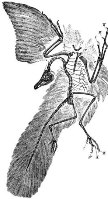
Figure 1 Iconic Archaeopteryx . This is the ‘Berlin specimen’, discovered in 1877 and now kept at the Humboldt Museum in Berlin. The ‘London specimen’, which Domínguez Alonso et al. 4 worked with, was discovered earlier (in 1861) and, although the head was separated from the body, it preserves the part of the skull enclosing the brain in exquisite detail.

Obtaining an understanding of the brain and sense organs is a top priority for palaeontologists, because such knowledge can offer insight into the behaviour of extinct organisms not otherwise provided by the skeleton. In the case of Archaeopteryx , from the beginning the question has been — could the oldest-known bird fly? In the past, answers have been sought from